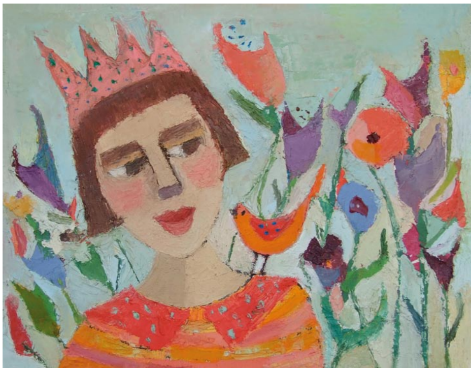
Olivia's Garden (22 x 28cm)

There will be a number of paintings available ex-catalogue