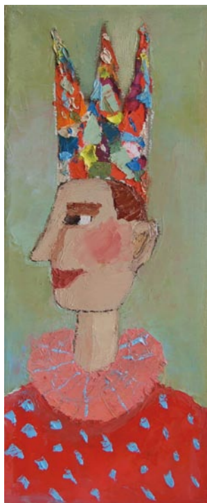
Pebble (28 x 12cm)