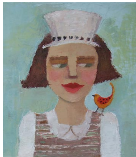
Jess (24 x 20cm)