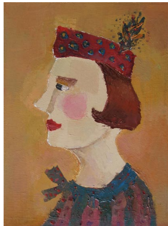
Simpson (32 x 24cm)