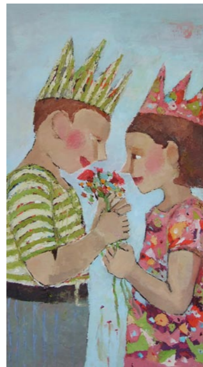
Ian and Isabelle (48 x 27cm)