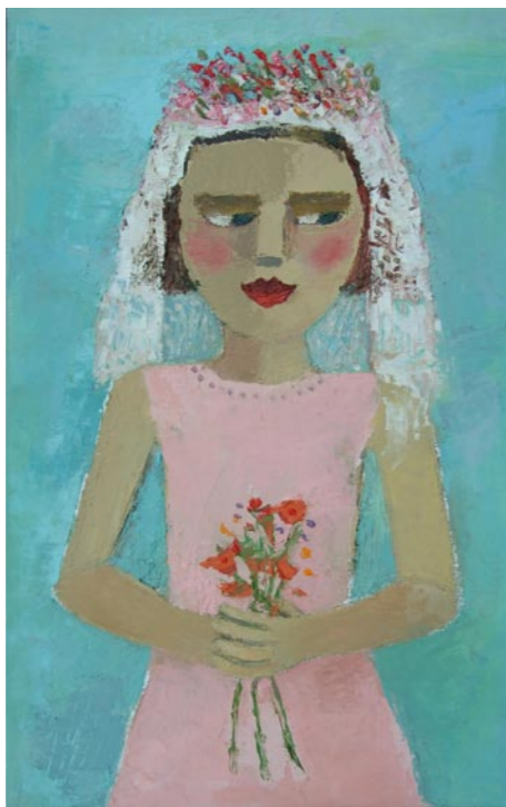
Stella (32 x 20cm)