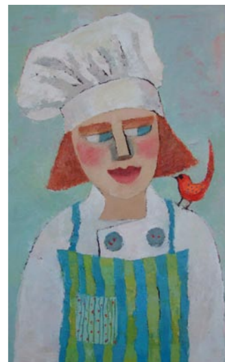
Little Song (54 x 35cm)