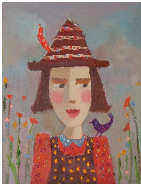
"Briar" (24 x 18cm)