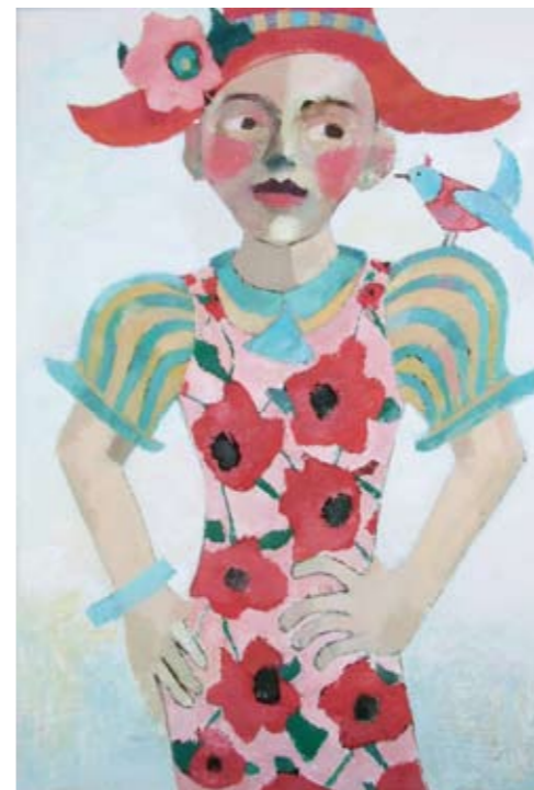
"Lady Silver" (92 x 61 cms)