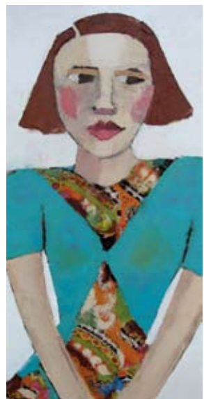
"Maxine" (60 x 30 cms)