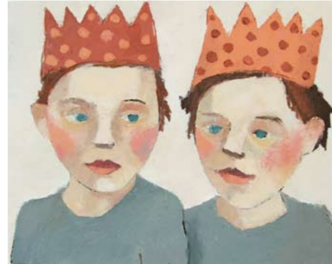
"The Party Girls" (40 x 50 cms)