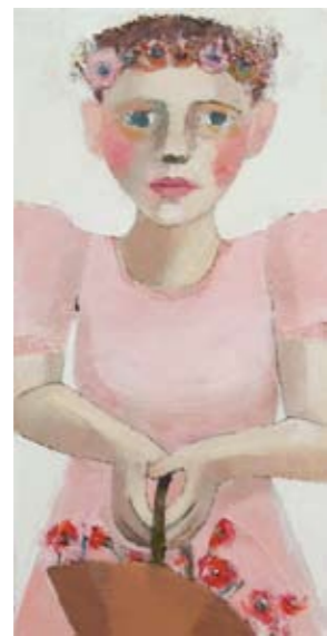
"Little Isabelle" (60 x 30 cms)