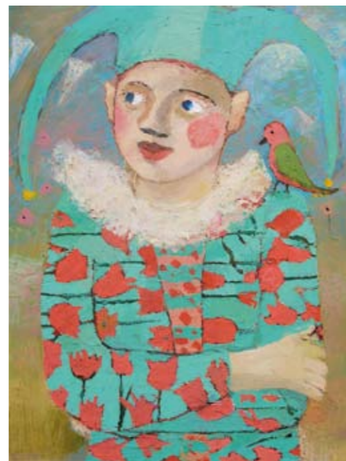
"Silly Billy" (80 x 60 cms)