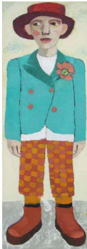
"Toby" (132 x 46 cms)

There will be a number of paintings available ex-catalogue.