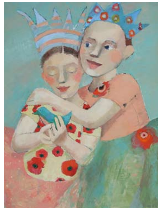
"Bluebird" (100 x 80 cms)