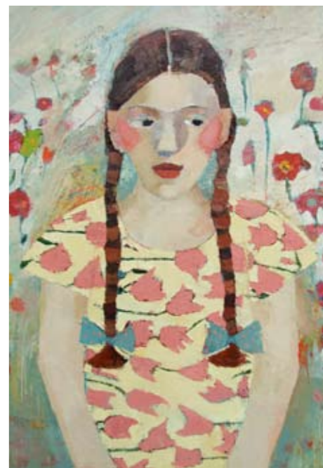
"Loretta" (92 x 61 cms)