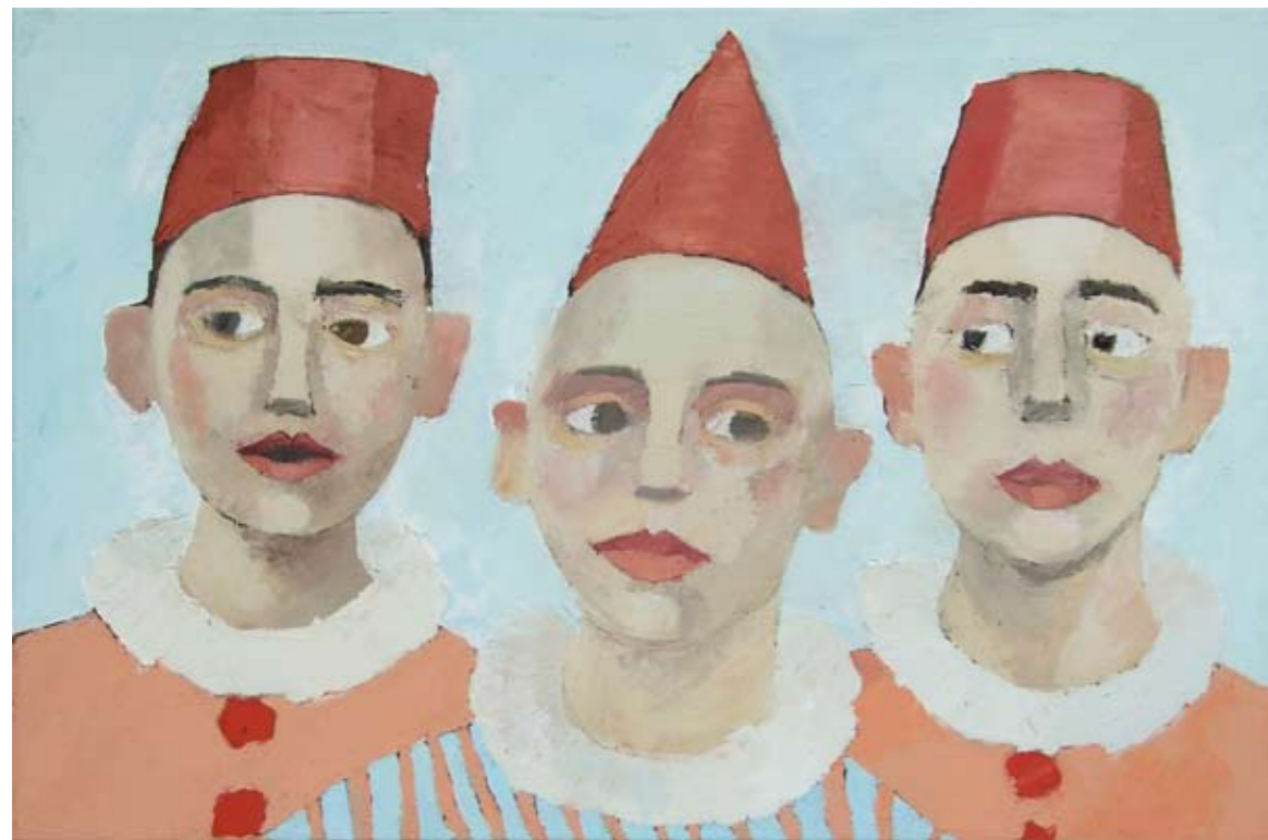
"The Apricot Brothers" (61 x 92 cms)