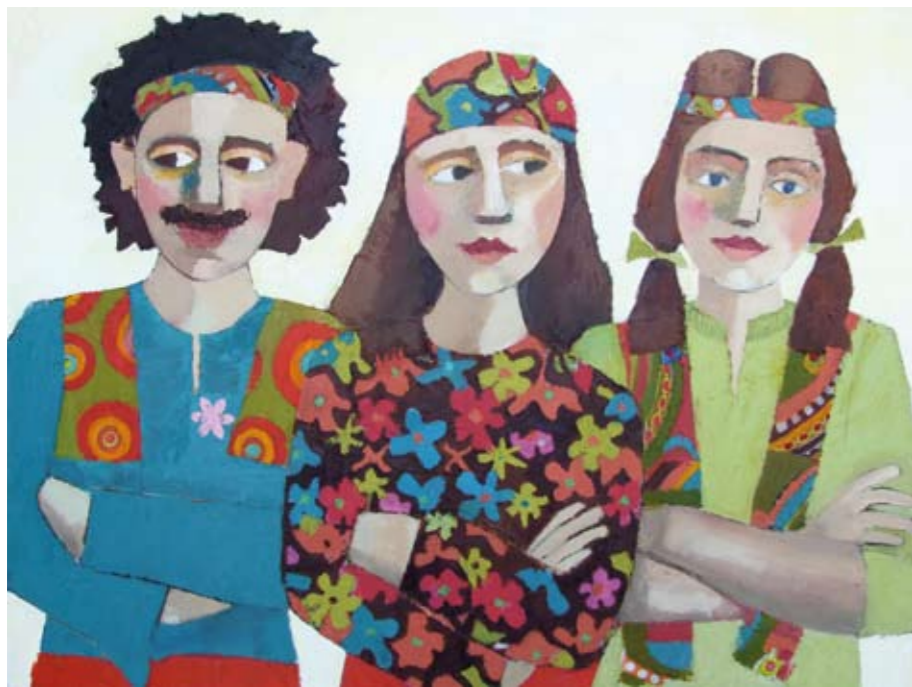
"The Summer of Love" (76 x 102 cms)

There will be a number of paintings available ex-catalogue.