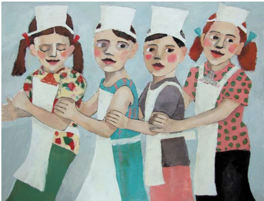
"The Merry Maids" (92 x 122 cms)