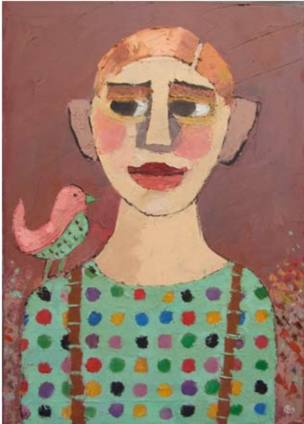
Ozzie 48 x 35cm