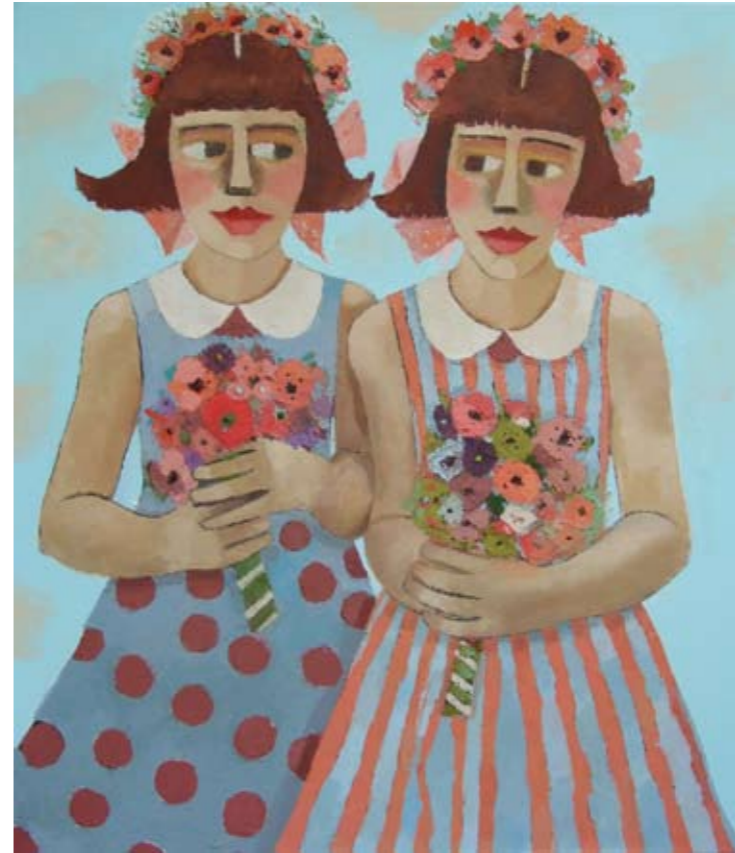
Maids of Honour 100 x 90cm