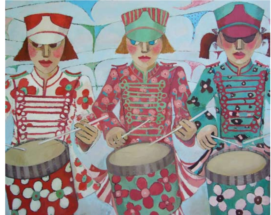
Captain Candy 102 x 127cm

Her passion for that story is written in many layers into this new body of work and in one form or another in every painting you will find the artist herself.