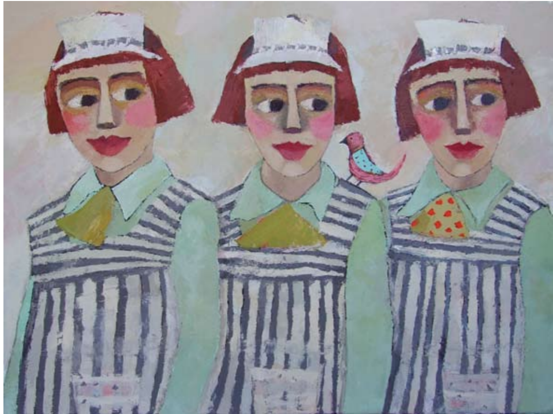
The Radcliffes 60 x 80cm