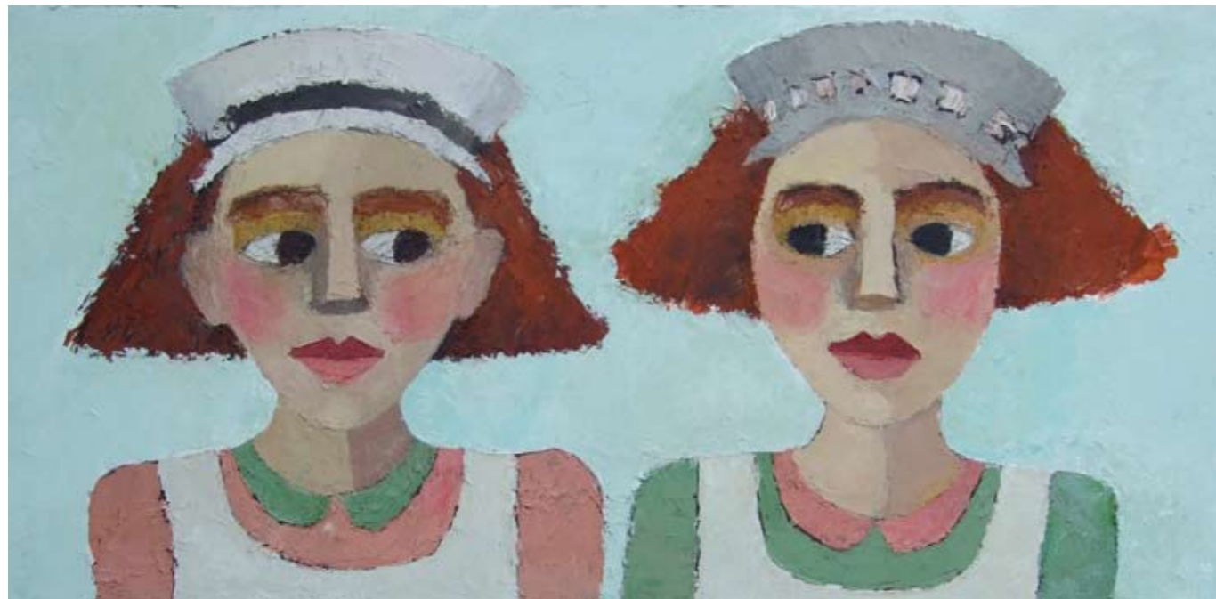
Nice Caroline 40 x 80cm

There will be a number of paintings available ex-catalogue