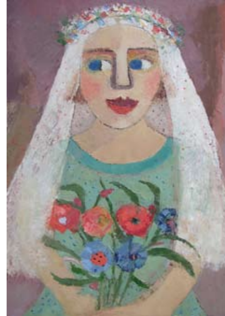
Rena 50 x 35cm