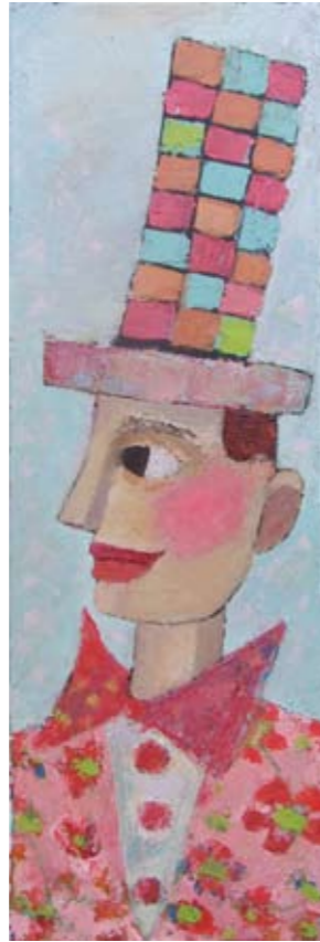
Bob's your Uncle 60 x 20cm