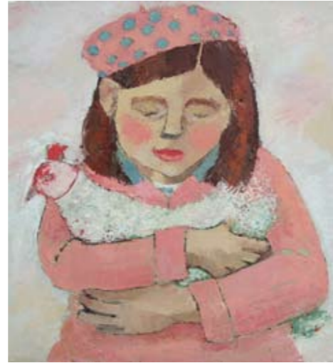
Rosie 50 x 45cm