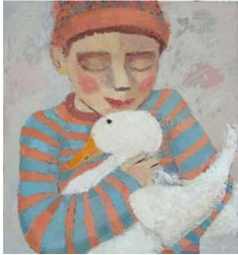
Robin's Brother 50 x 45cm