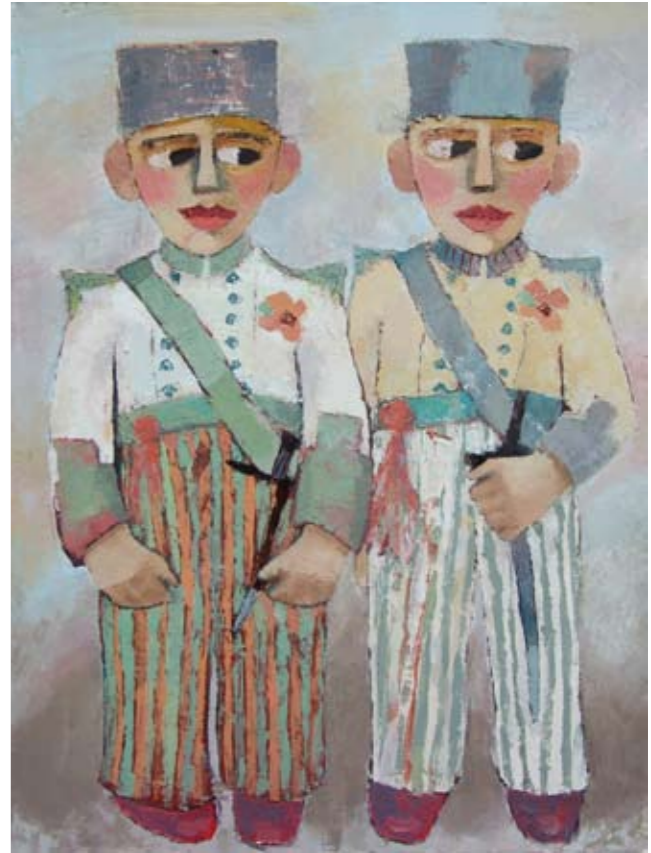
Soldier Boys 80 x 60cm