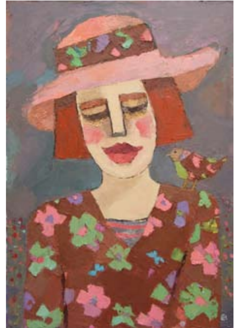
Matchmaker 50 x 35cm