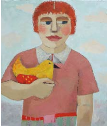
Hector 60 x 50cm